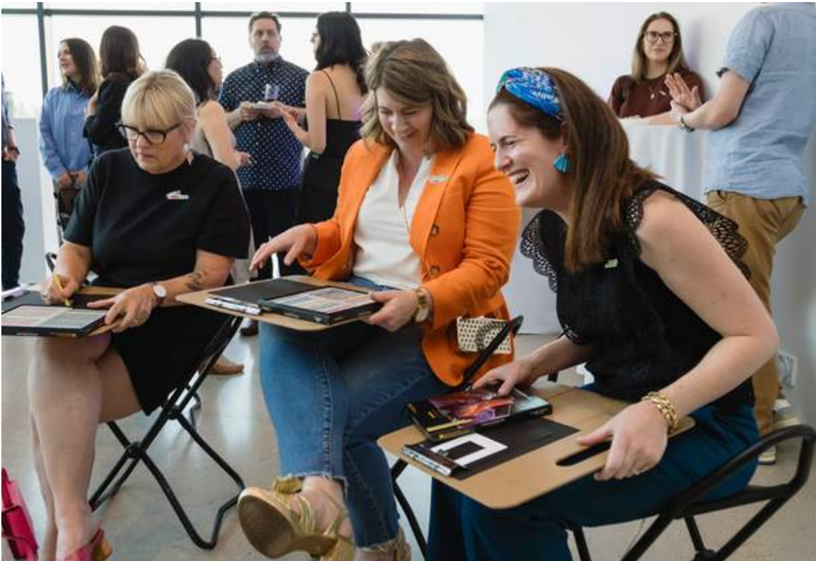
Circle of Supporters members take part in a still life drawing activity at a spring event.