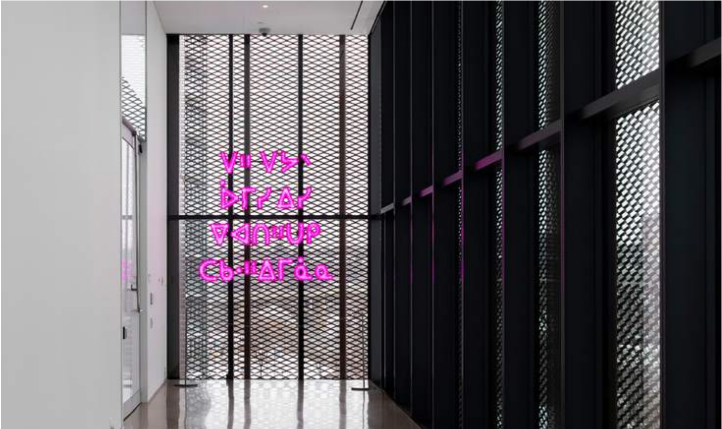
Installation view, Joi T. Arcand: V̄V̄V̄ ǀǂǂ ǂǂǂ ǂǂǂ ǂǂǂ ( pêh-pêyak ômisi isi ê-atihêki takwahiminâna ), 2025.