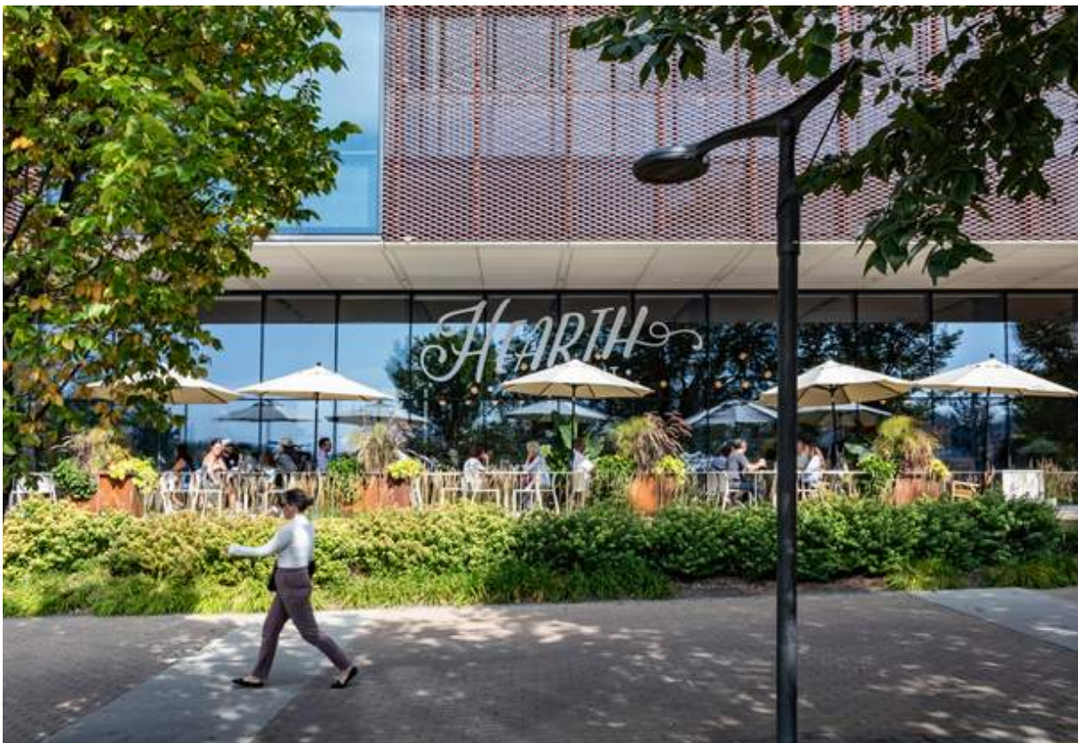
Hearth restaurant welcomed nearly 58,000 diners in 2025.