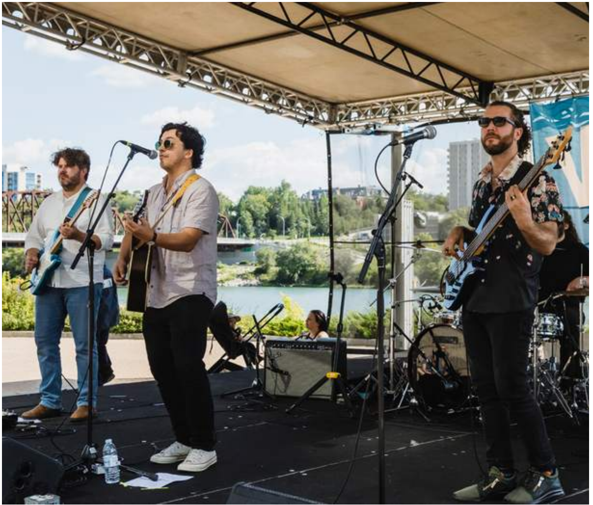
okimaw▷PL° performs at WEGO 2025.

In 2025, Learning & Engagement continued to reach audiences both at the museum and across Saskatoon, delivering hundreds of programs to around 50,000 participants of all ages. The museum also worked with 85 local community organizations to collaborate on programs that bring new audiences to the museum and provide support for groups to share important themes and conversations with their networks.