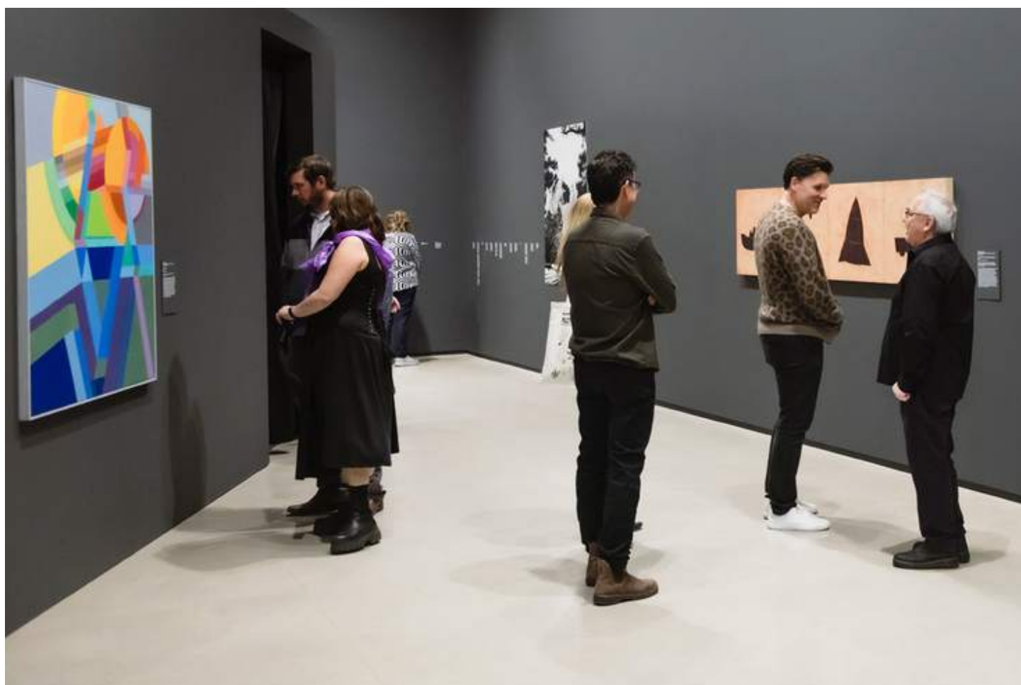
Installation view, Great Plains Series: Point of Departure, Space of Return, 2025, Rемаi Modern, Saskatoon.