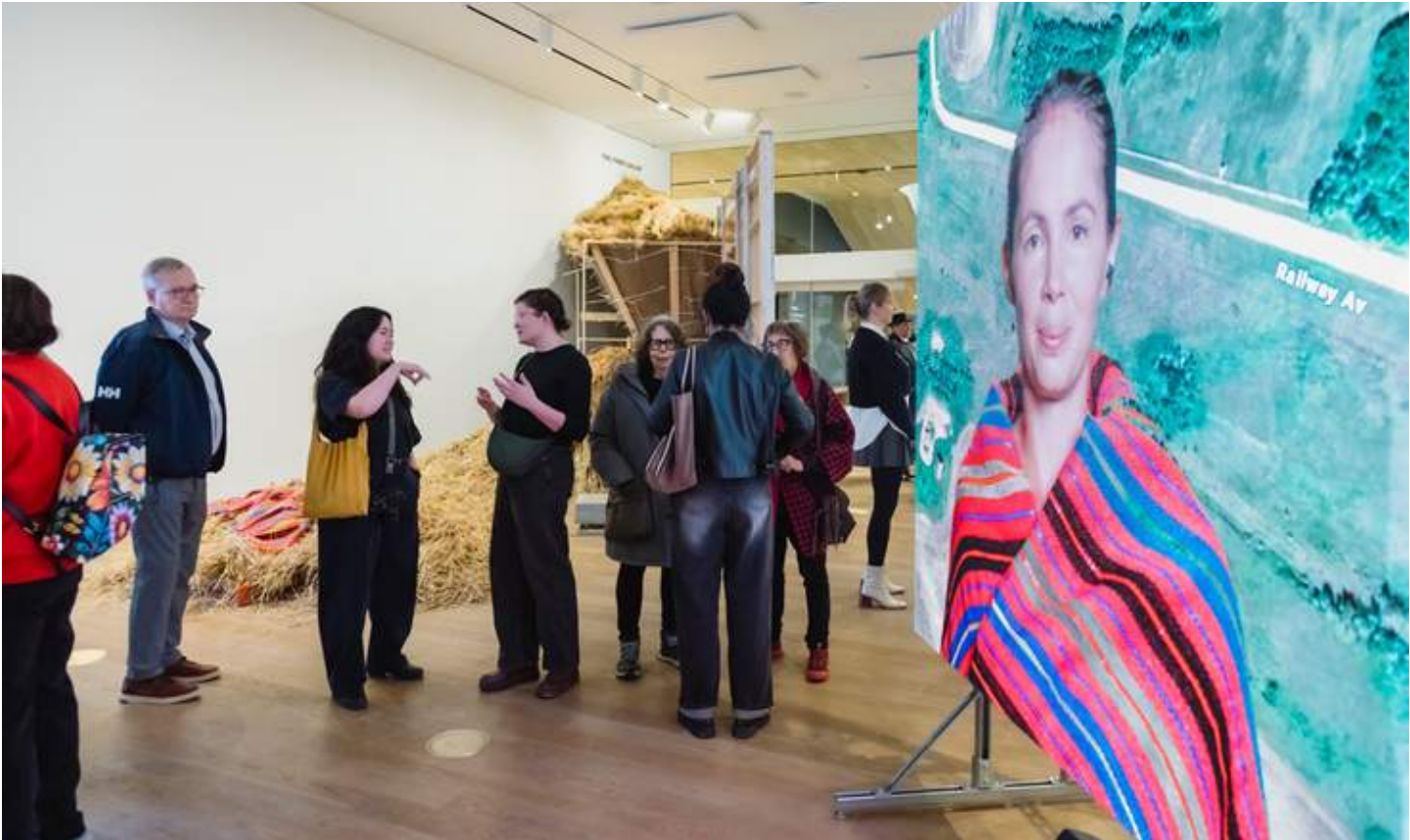
Installation view, Althea Thauberger: Der Kleiekotzer (The Bran Puker) , 2025.