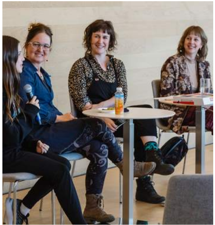
Panelists speak at the community screening for Belong Where You Find Yourself .