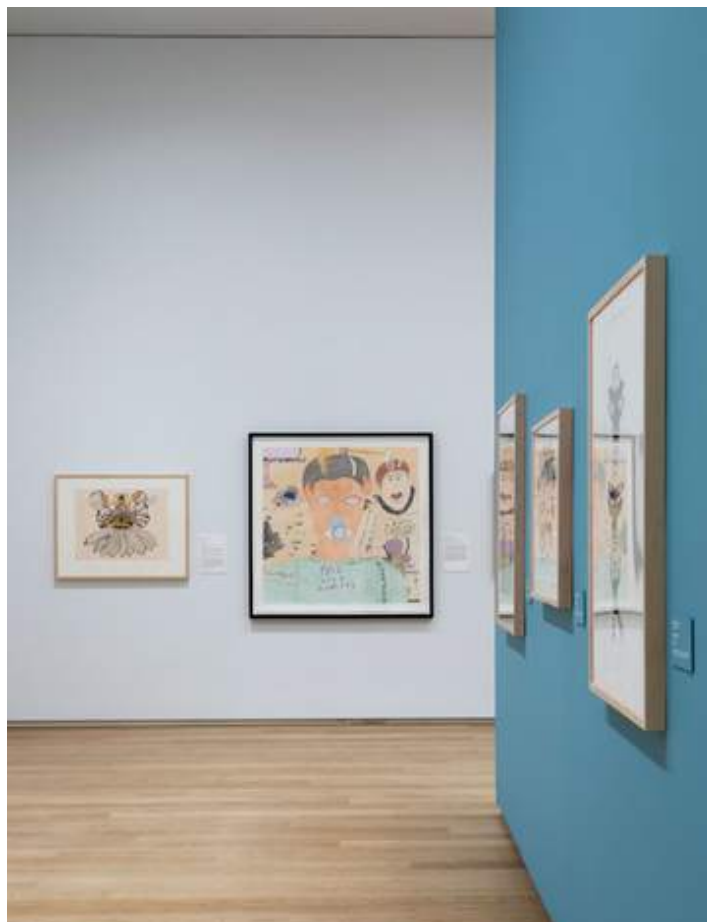
Installation view, World View , 2025, Remai Modern, Saskatoon.