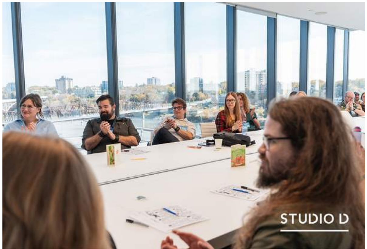
Large events, including the first-ever MEMO Fest, helped Operations reach its highest number of third-party guests to date.