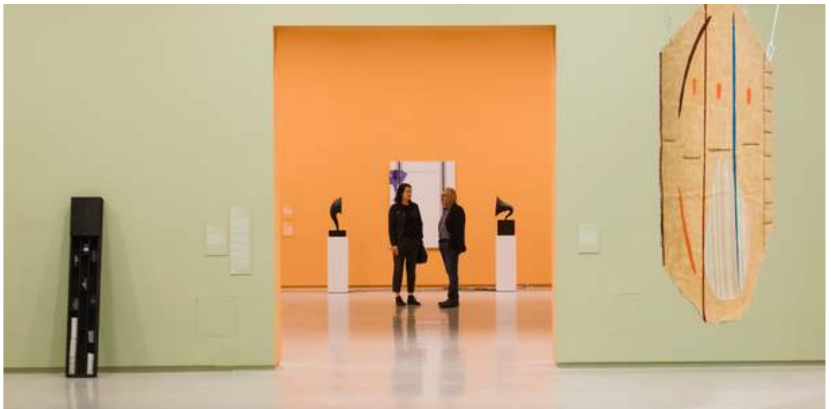
Above: Installation views, Great Plains Series: Points of Return – Spaces of Departure , 2025.