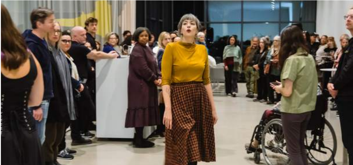
A performance of Sounding was part of the opening for Great Plains Series: Points of Return – Spaces of Departure .