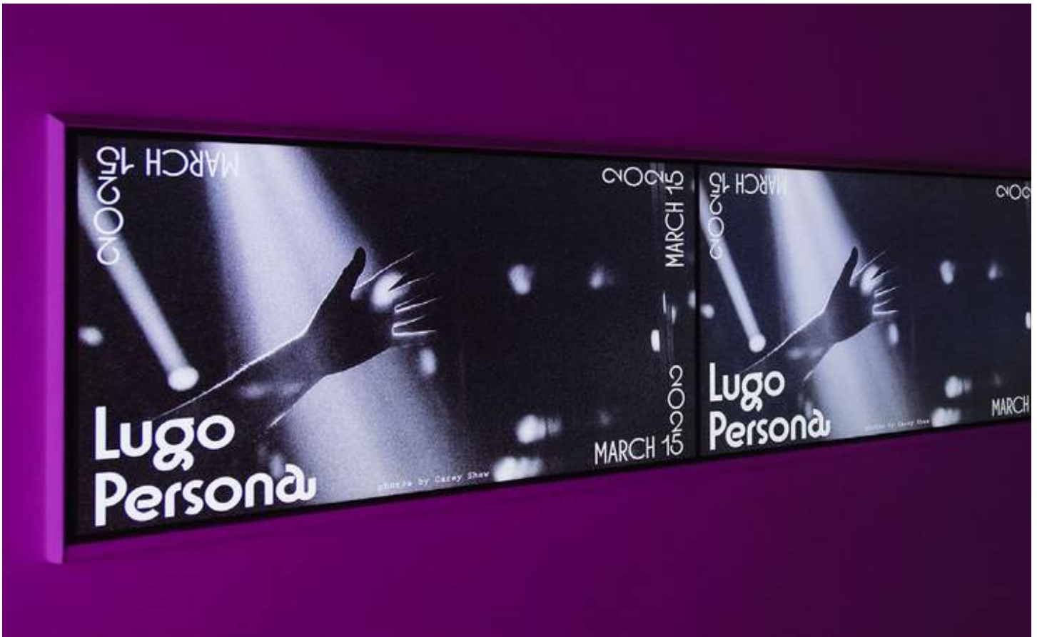
Digital screens at LUGO Persona.