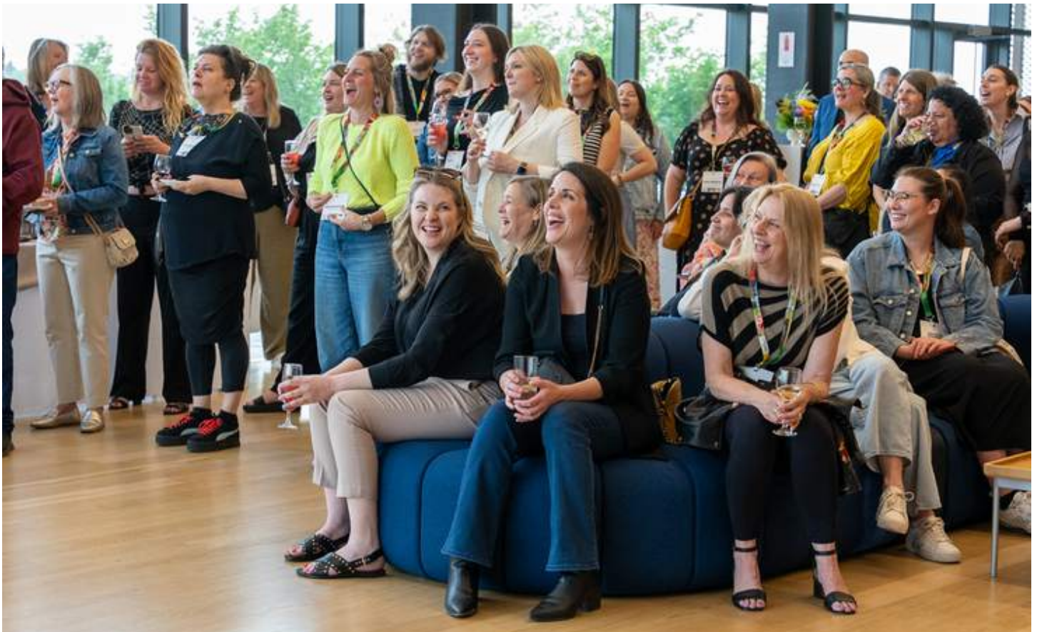
Remai Modern hosted the welcome reception for the Travel Media Association of Canada conference in June, bringing 200 travel writers and tourism professionals to Saskatoon.