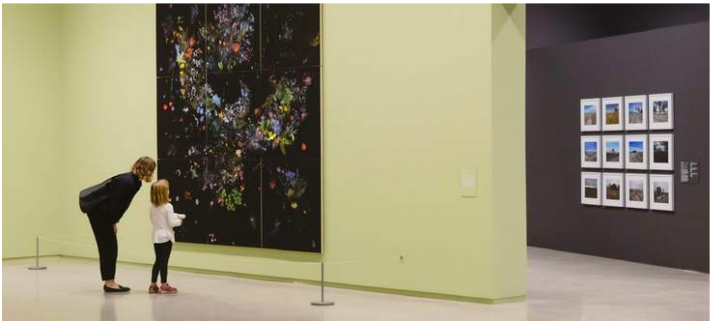
Installation views, Great Plains Series: Points of Return – Spaces of Departure, 2025.