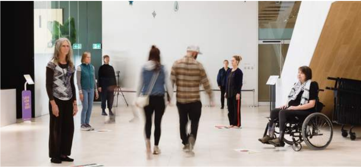
KSAMB Improvisation Scores: The Stand , October 18.