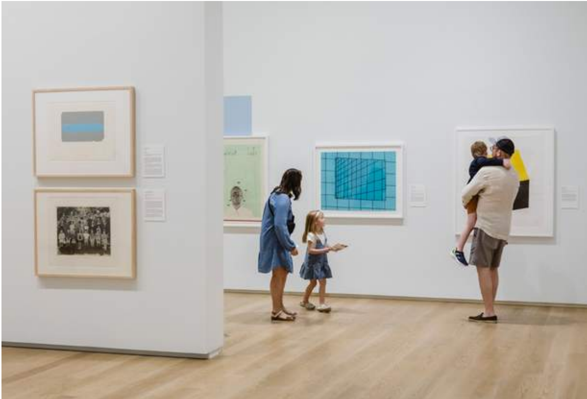
Installation views, Strong Impressions , 2025.